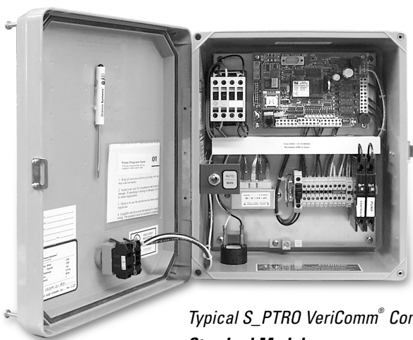
Typical S_PTRO VeriComm® Control Panel

VeriComm S1PTRO and S2PTRO remote telemetry control panels are used with timed dosing in simplex pumping operations. Coupled with the VeriComm web-based Monitoring System, these affordable control panels give water/wastewater system operators and maintenance organizations the ability to monitor and control each individual system's performance remotely, with real-time efficiency, while remaining invisible to the homeowner. VeriComm S1PTRO and S2PTRO panels allow remote operators to change system parameters, including timer settings , from the web interface.